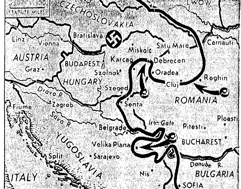
Arrows indicate Russian gains on the southern front, including a drive to the outskirts of Debreceen and an advance which cut the Belgrade-Nis highway and railroad.