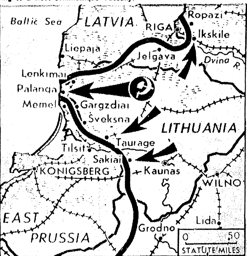
Large arrow shows Russian advance to the Baltic Sea at Palanga, cutting off Germans in Latvia. Other arrows show other gains reported by Moscow.